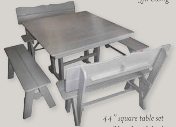
44" square table set 42" bench with back 42" bench