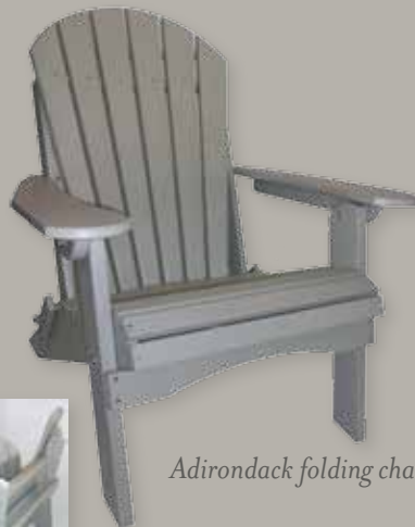
Adirondack folding chair