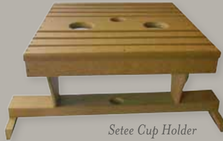
Settee Cup Holder