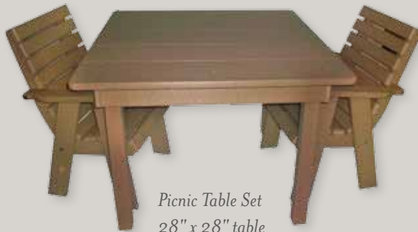
Picnic Table Set 28" x 28" table