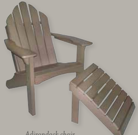
Adirondack chair Adirondack foot rest