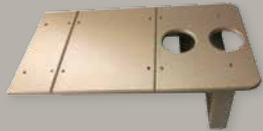
Console cup holder