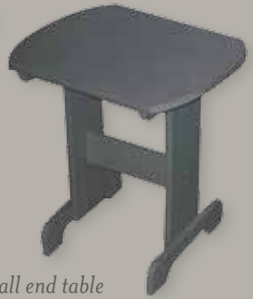
Small end table